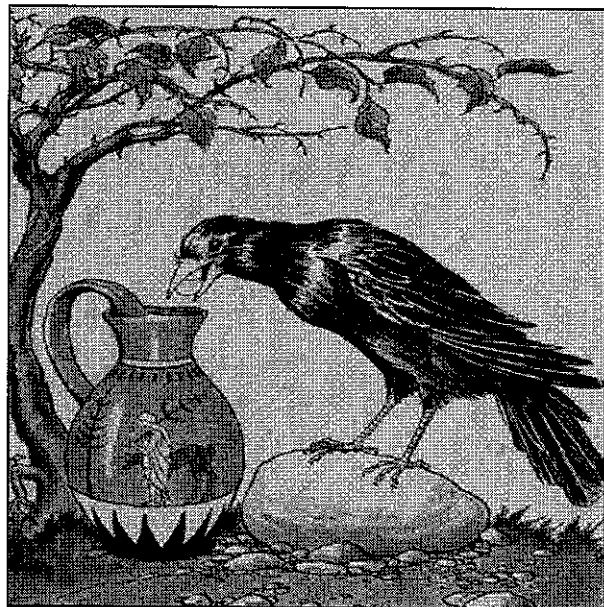
"The Crow and the Pitcher" by Milo Winter is in the public domain.

Then an idea came to him. Picking up some small pebbles, he dropped them into the pitcher one by one. With each pebble the water rose a little higher until at last it was near enough so he could drink.